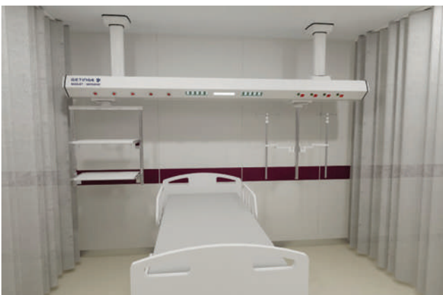
Rack & pole solution.

The Somnus light has been developed according to the Lighting Research Center Recommendations. Bluish tones simulate morning light, while reddish ones represent evening light (based on the Circadian Stimulus).