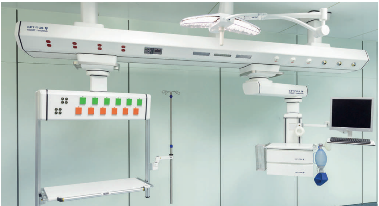
Premium solution with Sky Module.

Getinge has developed a horizontal solution to accommodate architectural constraints: Moduevo Bridge. This economical, space-saving ceiling supply unit is designed to enhance provider-patient interactions at all acuity levels by keeping everything close at hand. It can be installed in intensive care and high-dependency care units, recovery and emergency departments.