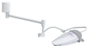
Maquet Lucea 40: wall version