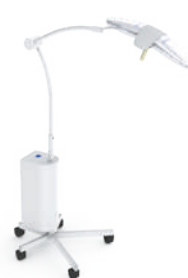
Maquet Lucea 100: mobile version with battery