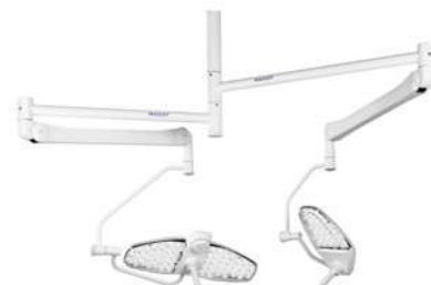
Dual Maquet Lucea 50/100 DF: ceiling version