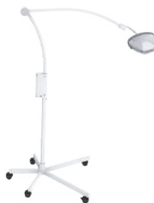
Maquet Lucea 40: mobile version