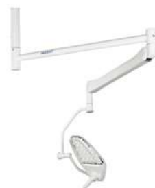
Maquet Lucea 50 DF: ceiling version