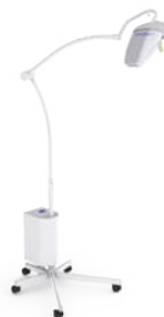
Maquet Lucea 50: mobile version with battery