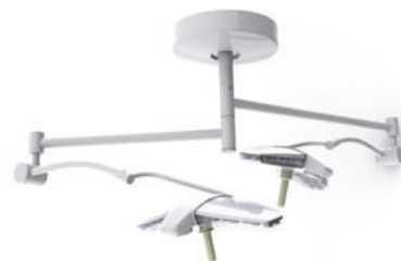
Dual Maquet Lucea 100: ceiling version