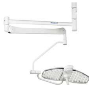
Maquet Lucea 100 DF: ceiling version