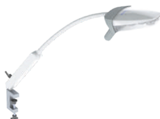
Maquet Lucea 10: rail version