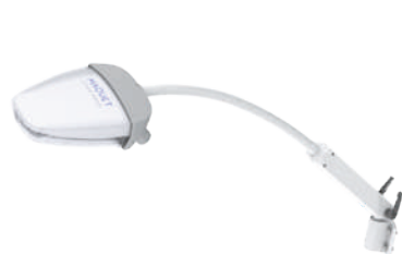
Maquet Lucea 10: wall version