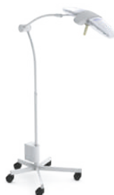
Maquet Lucea 100: mobile version