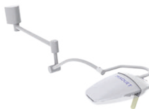
Maquet Lucea 50: wall version