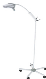
Maquet Lucea 10: mobile version