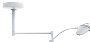
Maquet Lucea 40: ceiling version