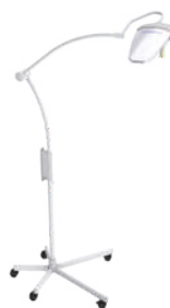
Maquet Lucea 50: mobile version