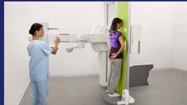
Chest examination at table with source image distance (SID) of 183 cm (72")