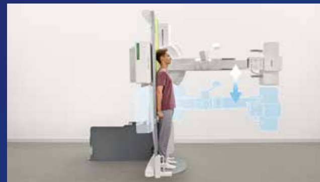
Stitching examination at table with max. body coverage of 150 cm (59")