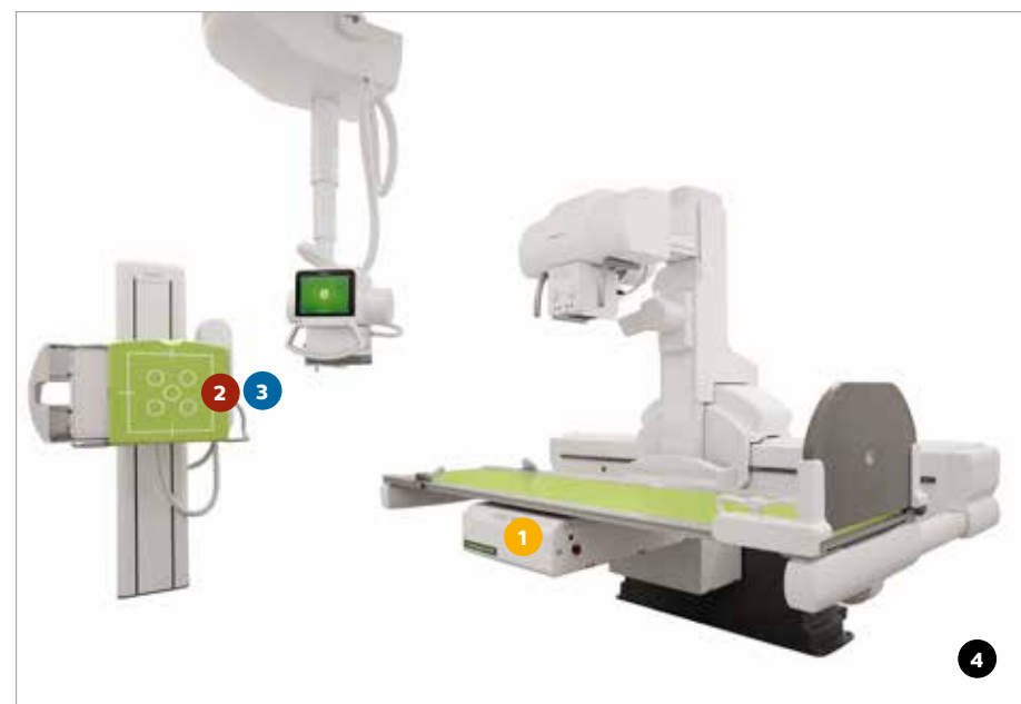
High Performance Room Dynamic detector in table, 2 nd tube, fixed or SkyPlate detector in vertical stand, optional portable SkyPlate detector