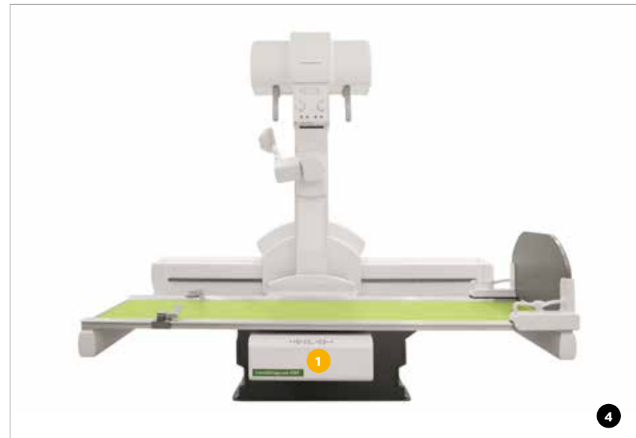
Classic Room Dynamic detector in table, optional portable SkyPlate detector