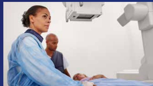
Perform Digital Subtraction Angiography (DSA) examinations with the ease of Eleva