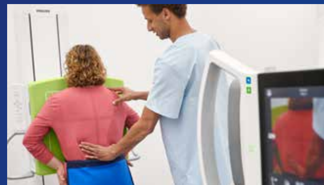
Experience fast workflow with ceiling suspended Eleva Tube Head with optional Live Camera Package

Utilizing the ceiling suspended Eleva Tube Head speeds up the radiography workflow by 28 seconds per examination. 2,3